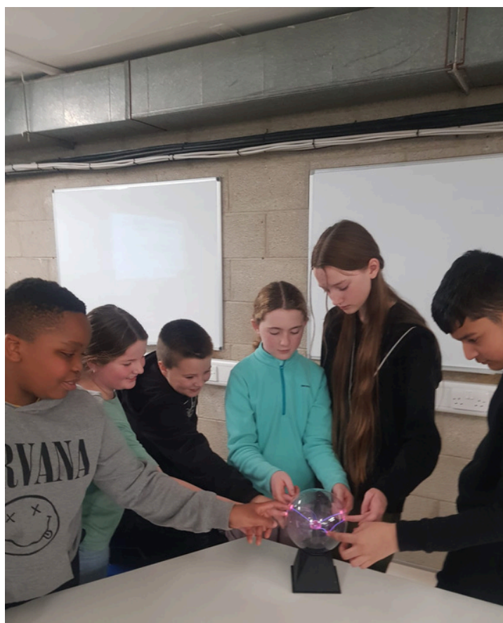
5th & 6th class during science week

The P.T.A. will also be serving teas and coffees before the show, so if you can help out for a little while, please let them know at: pta@smnslimerick.ie