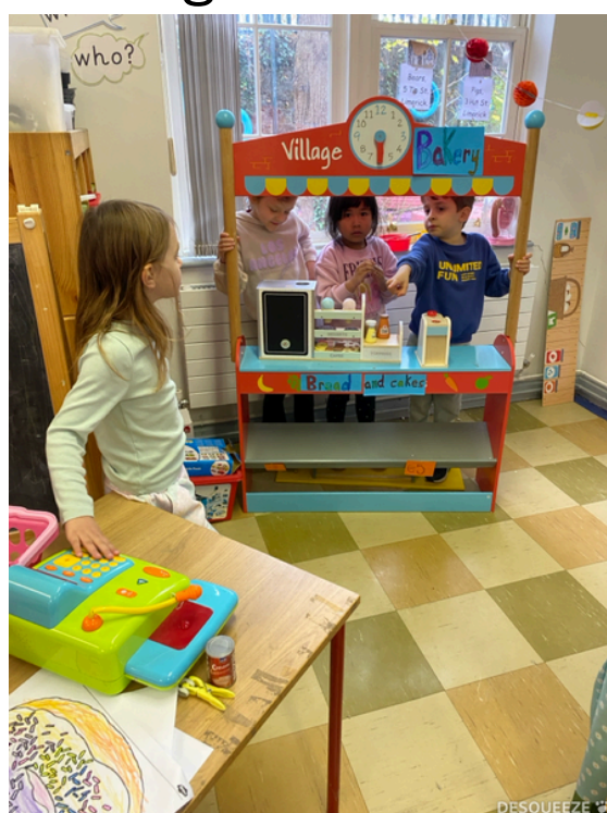
Infants having fun playing in 'The Bakery' role play area.