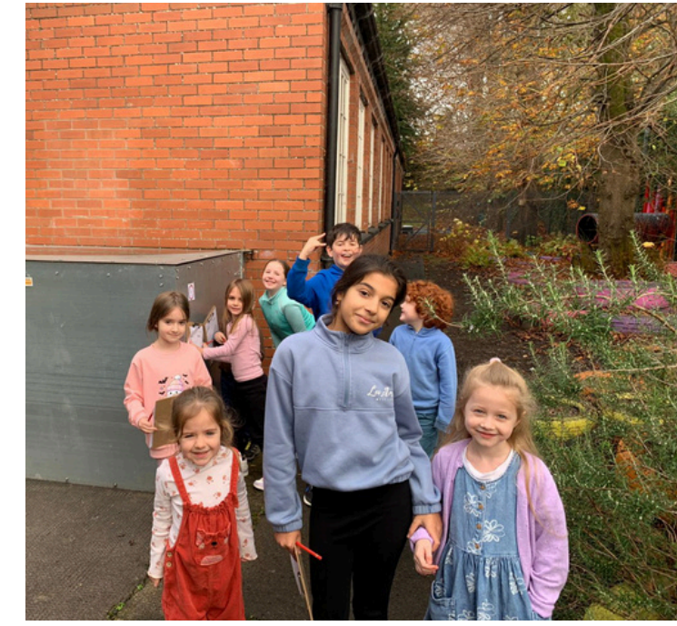
4th & 5th class working with Infants during maths week.