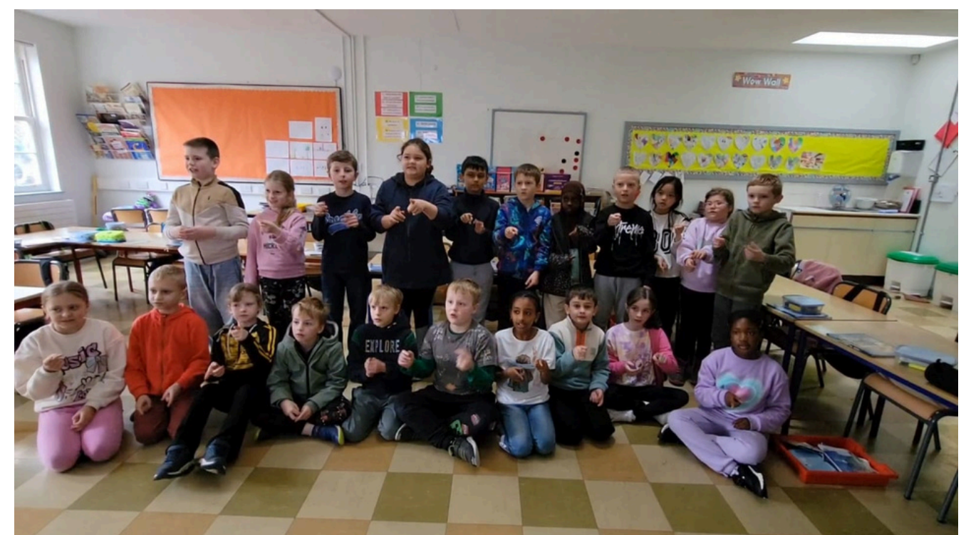
2nd & 3rd class singing and signing 'Count On Me'