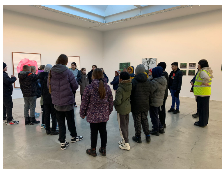
4th & 5th class visit to Limerick City Gallery