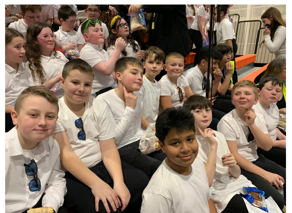
4th, 5th & 6th classes at Peace Proms