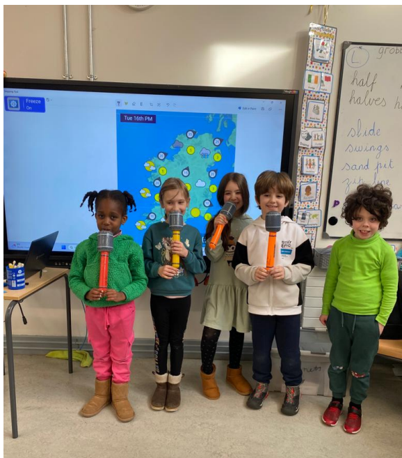
Senior Infants and 1st trying their hand at being weather forecasters

The next P.T.A. event will be a social event in the school and all are welcome to attend. Details will be sent next week.