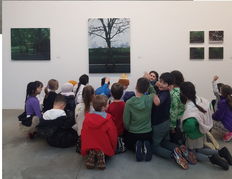
2nd and 3rd class visit to Limerick City Gallery