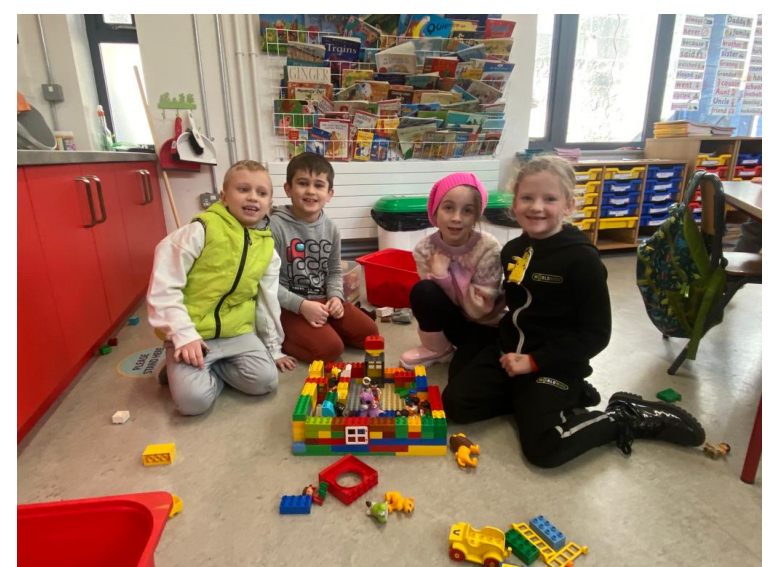
1st class and their Lego creation