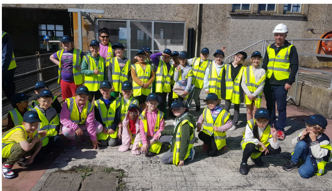
2nd & 3rd class at Ardnacrusha Power Station