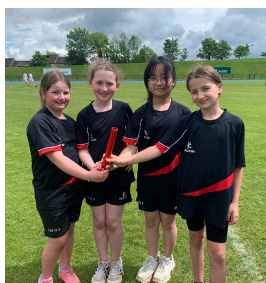
UL Primary School Sports Day