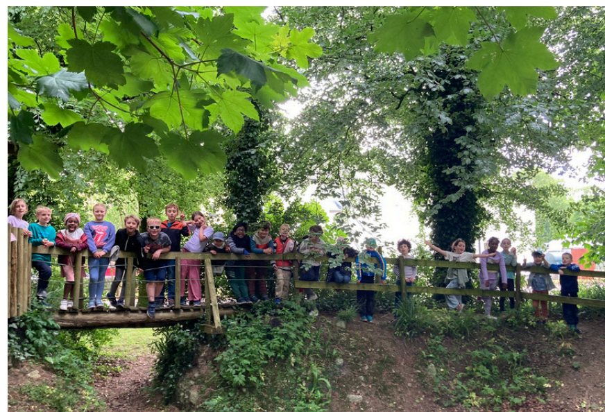
Junior Infants, Senior Infants & 1st class school tour