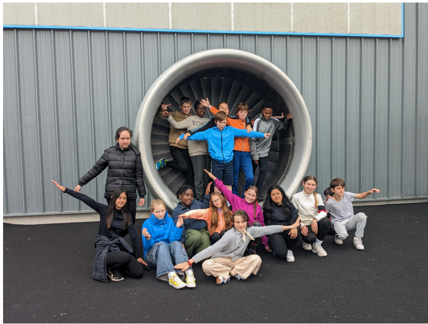
6th class visit to the Aviation Museum