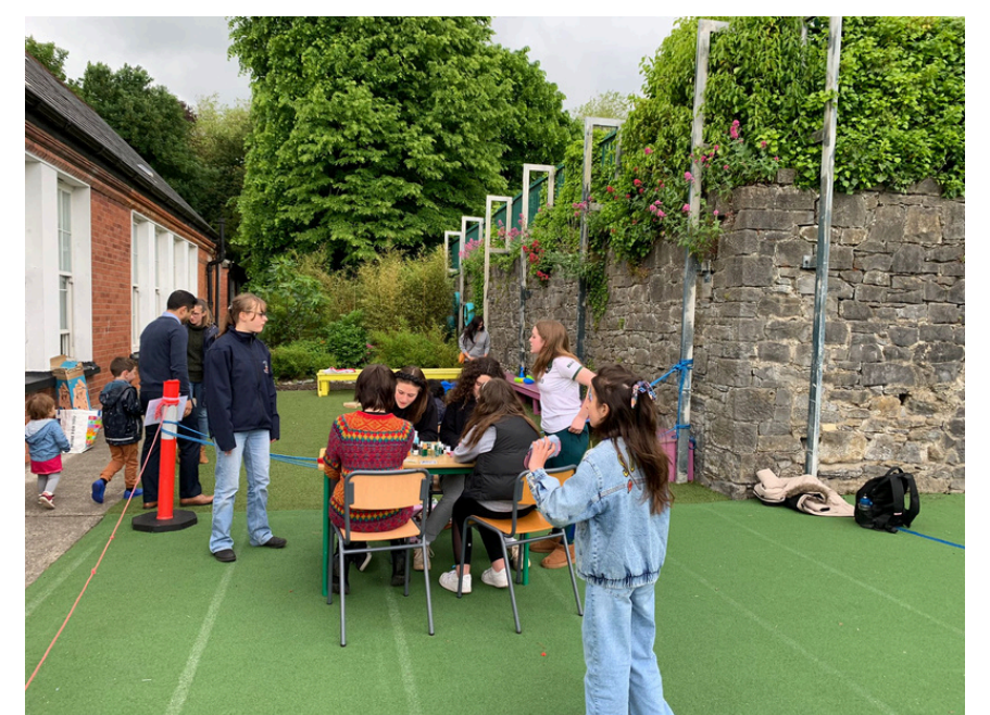
Family Fun Evening