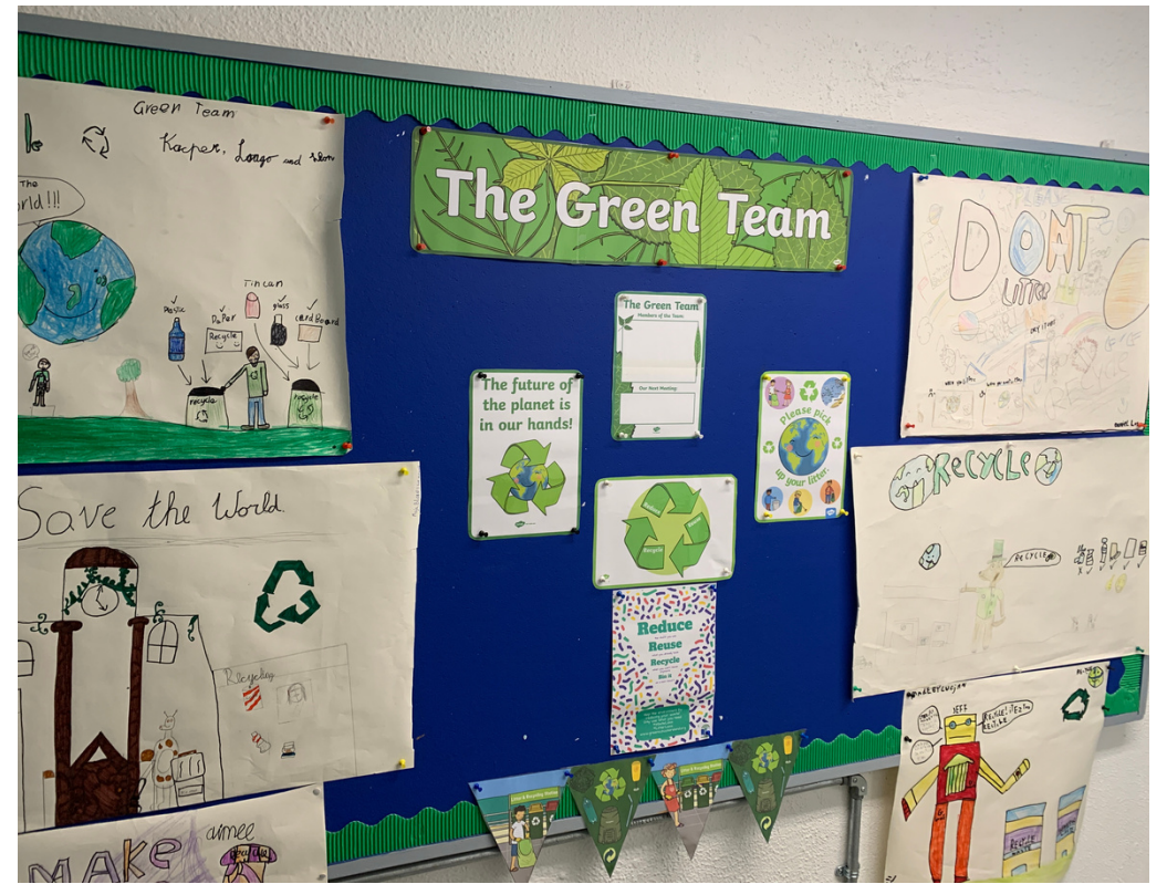
Our Green Schools display